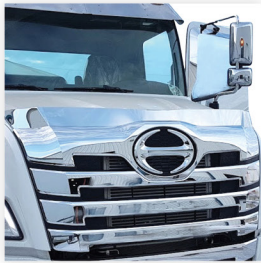
HOOD DEFLECTOR S7H21006

EXCEPTIONAL ITEMS IN BOTH 304 AND 430 TO SPECIFICALLY ENHANCE HINO XL 2020