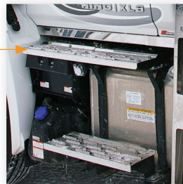
SIDE STEP DRIVER UP C7H71033

Without light, with exhaust on bottom and sides (2pcs)