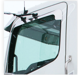
WINDOW DEFLECTOR S7H32004