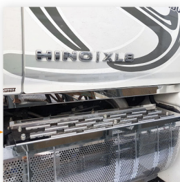
SIDE STEP PASSENGER UP C7H71035

XL fuel tank 70 gallons Length: 30" Depth: 7"