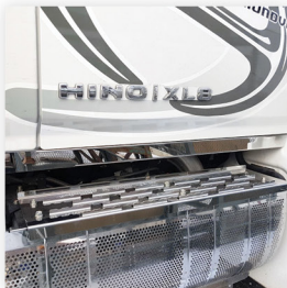
CAB PANEL S7H32005

Without light, with exhaust on bottom and sides (2pcs)