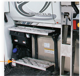
SIDE STEP DRIVER DOWN C7H71034

XL fuel tank 70 gallons Length: 34" Depth: 11" / Facilitates the exit of the cabin by maximizing the support of the feet. Usually installed with the cab panel.