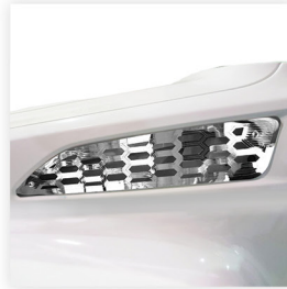
AIR INTAKE INSERT FOR HOOD S7H21007